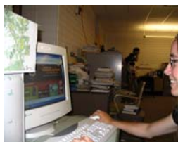
Figure 2. Technology transfer via websites, email, or computer simulations.