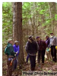
Figure 4. Technology transfer via forest health professional site-visit.