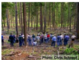
Figure 1. Technology transfer via hands-on field demonstration.

Technology transfer is the dissemination of research. While mandated by the Forest Service, little information exists outlining current use and preferences of Forest Service personnel for different technology transfer mediums. This research will assess current and preferred communication mediums of forest health research information through the use of a survey.