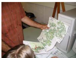
Figure 3. Technology transfer via maps.